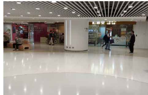
Location A: Outside Shop Nos. 46-48 Usable Area (approx.): 100 sq. ft.